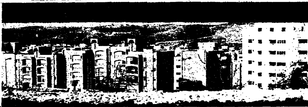
Housing units at Ramat Eshkol march on to conquer the Judean Hills.